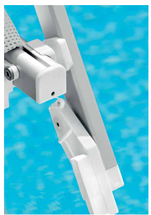
Sunbed Mod. 500 without spacer.